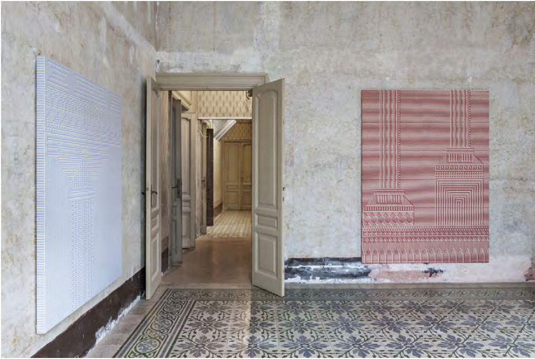
"TAUBA AUERBACH and CHARLOTTE POSENENSKE"